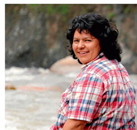
HONDURAN ENVIRONMENTAL ACTIVIST BERTA CÁCERES WAS MURDERED IN MARCH 2016

SINCE 2009, THE NUMBER OF MURDERED ENVIRONMENTALISTS HAS RISEN FROM 1 TO 4 A WEEK